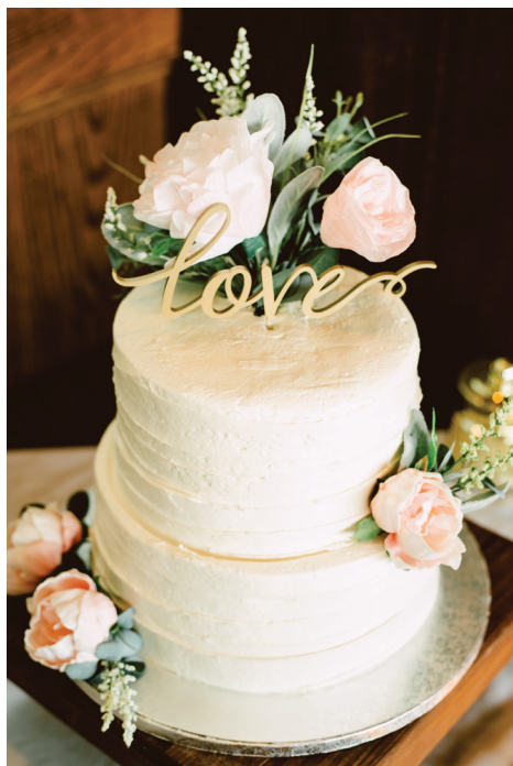
Paper roses from Paper Heart Blooms decorate a wedding cake. They are mixed with artificial greenery.

Harriett Hendren: 859-231-3175, hhendren@herald-leader.com