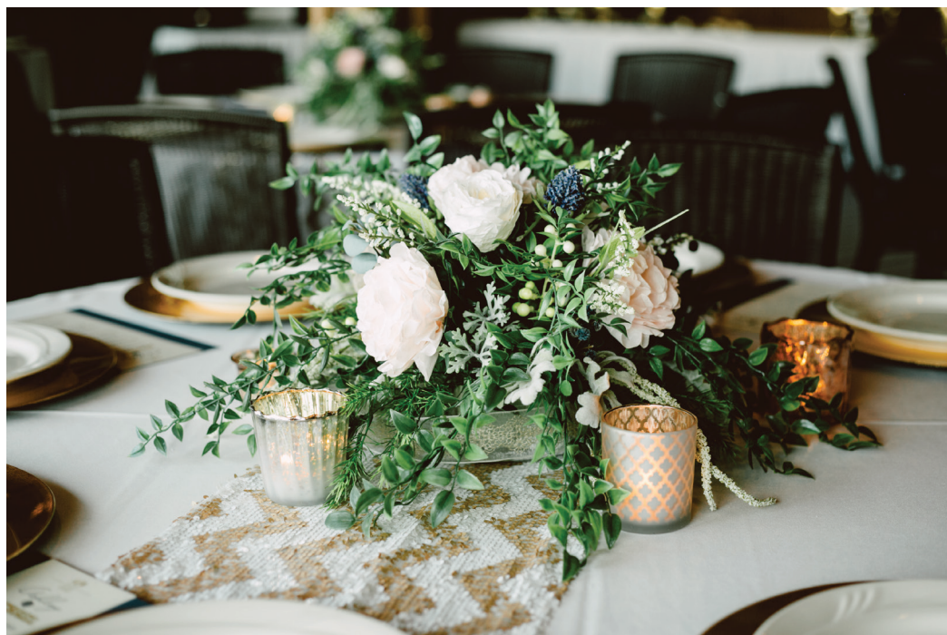
A centerpiece from the 2015 wedding of Ashley Cox. The bouquet is a mix of artificial greenery and paper flowers created by Cox.